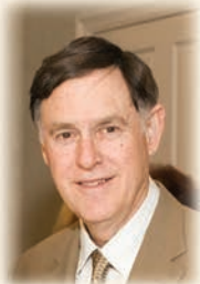
Senator Paul Steinberg